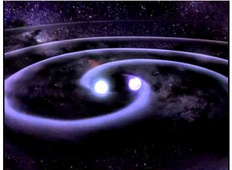
An artist's rendition of a neutron star merger.

Nuclear reactions in stars and in their final supernova explosions are responsible for the creation of light elements from beryllium to iron in the Universe. On the other hand, the astrophysical sites responsible for the production of heavier elements, such as silver and gold, are still poorly understood. It is currently under discussion whether neutron star mergers (NSMs) or core-collapse supernovae (CC SNe) have been the main source of elements forged by the rapid neutron capture process (r-process). In theory, galactic chemical evolution (GCE) simulations can test these two scenarios by comparing their respective predictions with observations, e.g. with europium abundances in observed galaxies. The GCE simulations reveal that both scenarios, the CC SNe and the NSMs scenario, are able to produce the chemical evolution trends of europium, as well as a combination of both, so that further constraints are required in order to identify the main astrophysical site of the r-process.