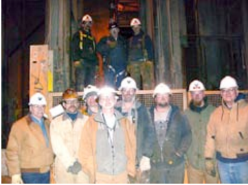
Contractors and Sanford Lab technicians pose on the new two-tiered work deck in the 4850 foot Yates Shaft