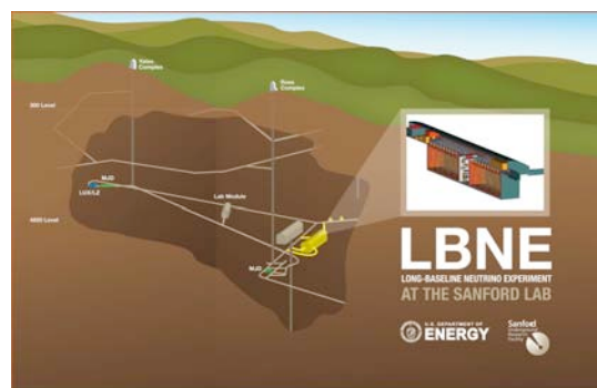
Figure 1: Illustration of what the Long-Baseline Neutrino Experiment Facility underground detector complex might look like at Sanford Laboratory

While noting that “LBNF is the highest priority large project in its timeframe,” the panel concluded that “to address even the minimum requirements specified (above), the expertise and resources of the international neutrino community are needed. A change in approach is therefore required. The activity should be reformulated under the auspices of a new international collaboration, as an internationally coordinated and internationally funded program, with Fermilab as host.”