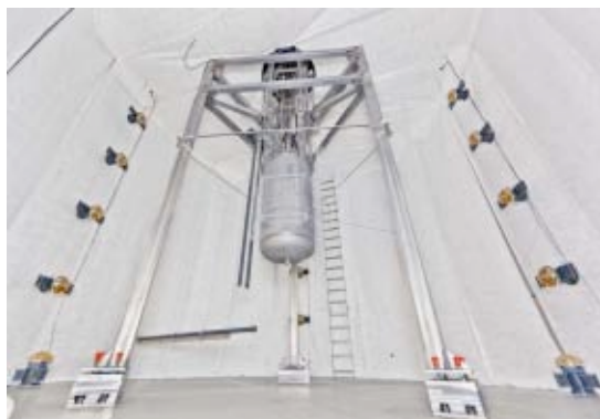
Figure 2: The LUX dark matter detector, inside its water tank

The United States would continue to be a leader in particle physics, playing a major role at the Large Hadron Collider at CERN, hosting a world-leading neutrino program, and participating in the development of a proposed international linear collider, which may be built in Japan. These efforts, focusing on international collaboration and scientific cooperation, would be aided by specific investments from the DOE’s Office of Science and the NSF Directorate for Mathematical and Physical Sciences.